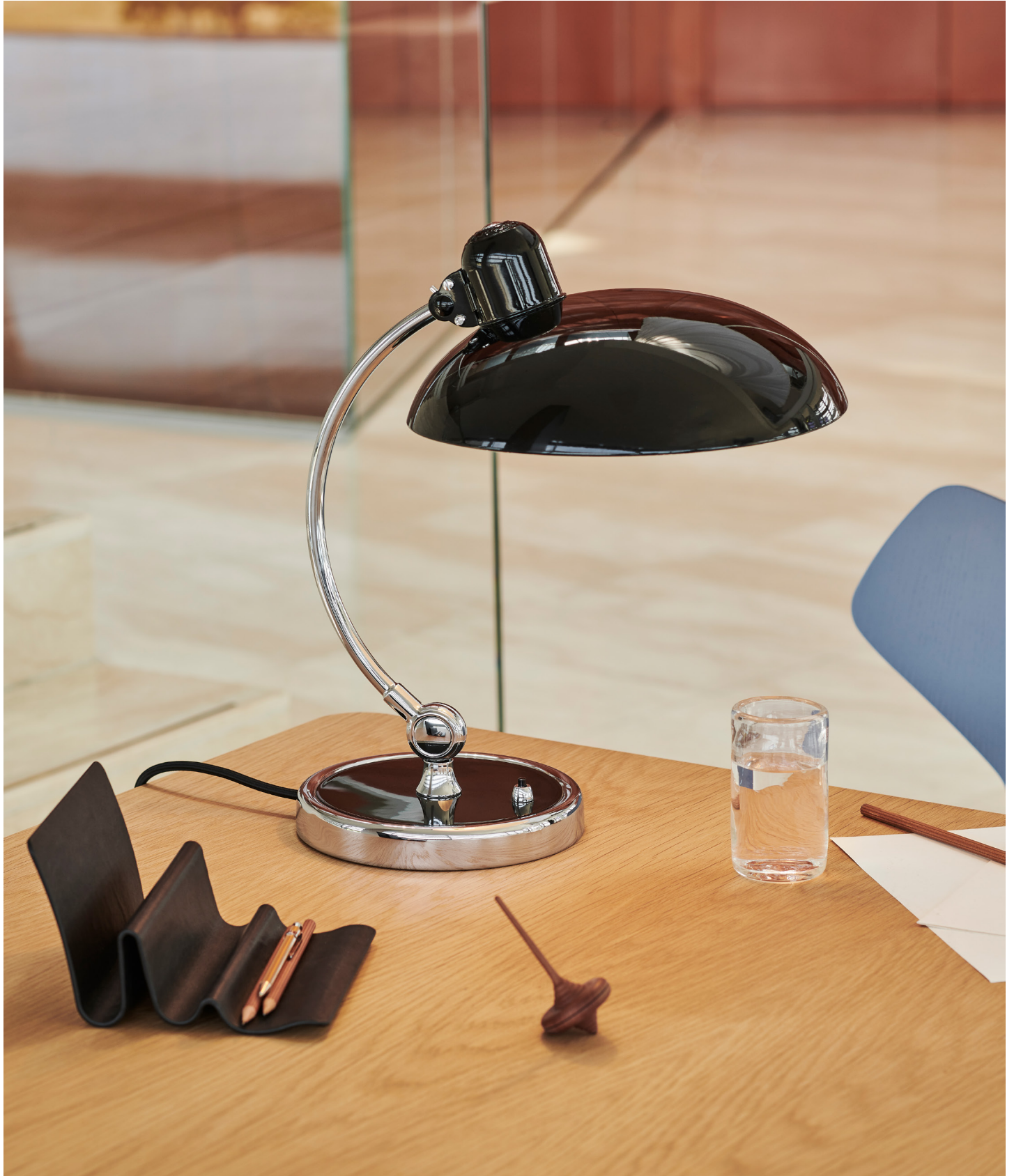
KAISER idell™ - 6631-T LUXUS PRODUCT FACT SHEET