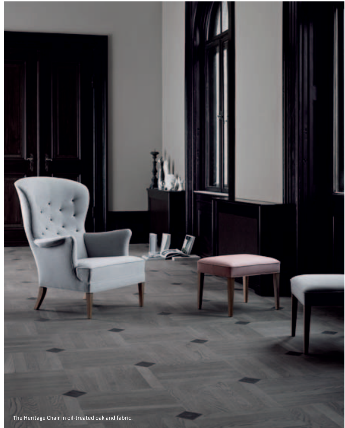
The Heritage Chair in oil-treated oak and fabric.