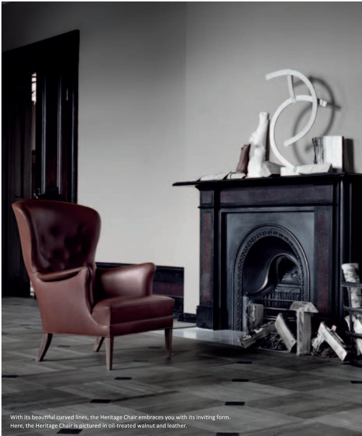
With its beautiful curved lines, the Heritage Chair embraces you with its inviting form. Here, the Heritage Chair is pictured in oil-treated walnut and leather.