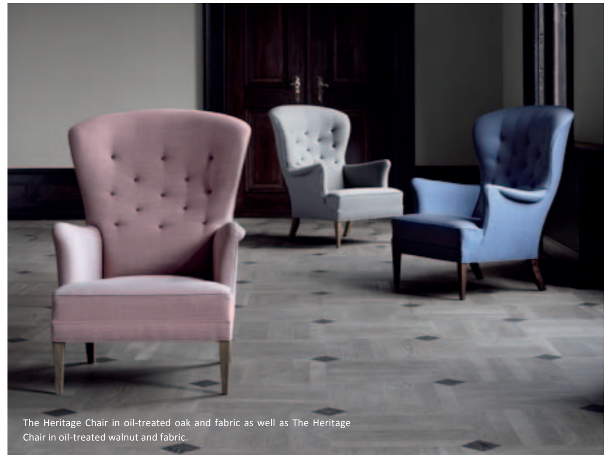
The Heritage Chair in oil-treated oak and fabric as well as The Heritage Chair in oil-treated walnut and fabric.

The mounting interest in Frits Henningsen's furniture in recent years is not surprising. Each of his pieces is, after all, characterized by soft, elegant lines and quality throughout, down to the smallest detail.