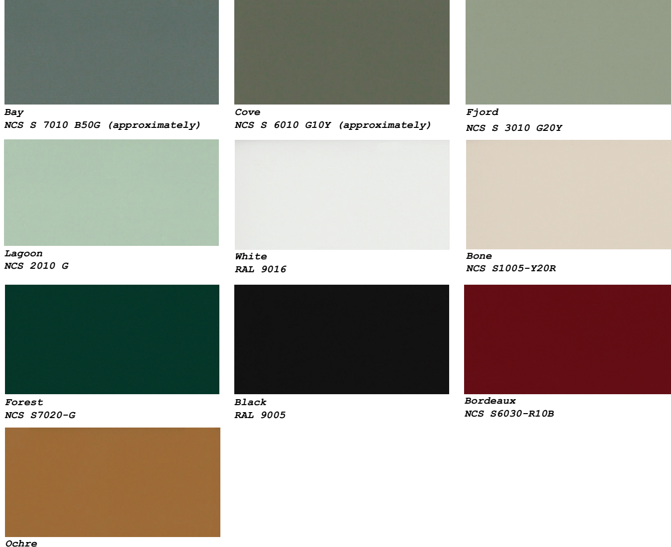
Ochre NCS S 4040-Y20R

Fibreglass is painted to create our satin matte finish, or painted then coated in clear lacquer to create our gloss finish.