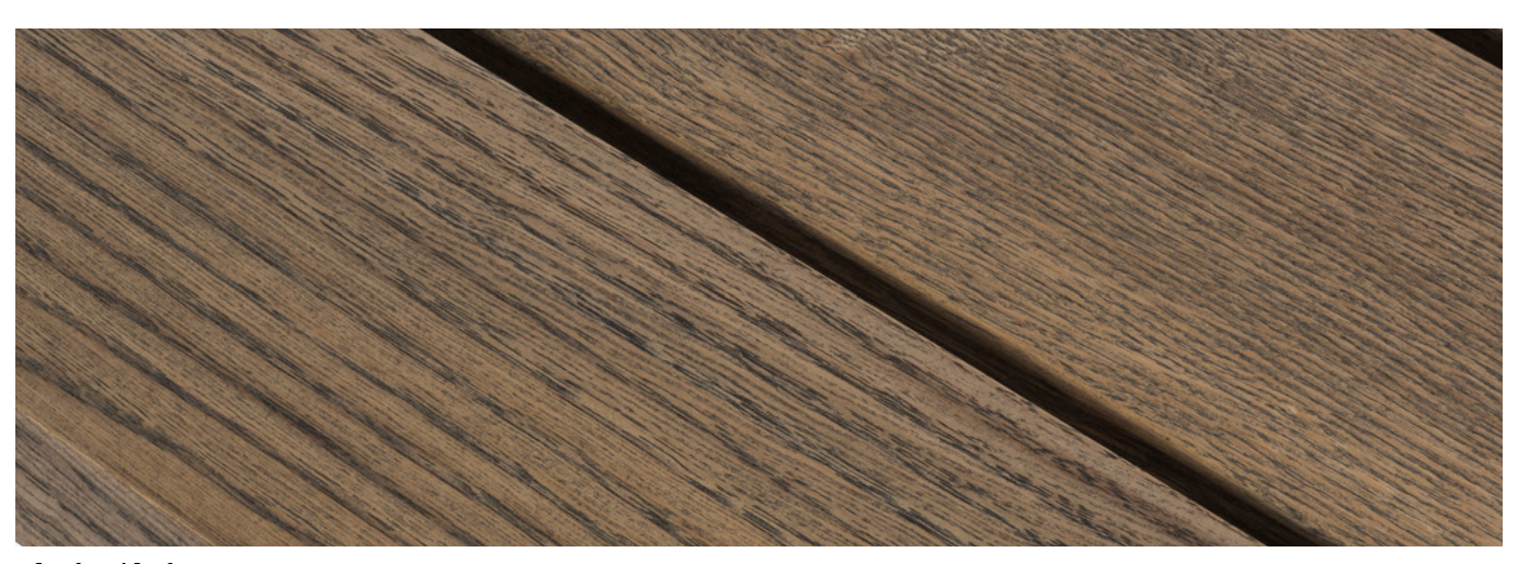
Black oiled European Oak

Our black oil finish provides a renewable surface for enduring beauty.