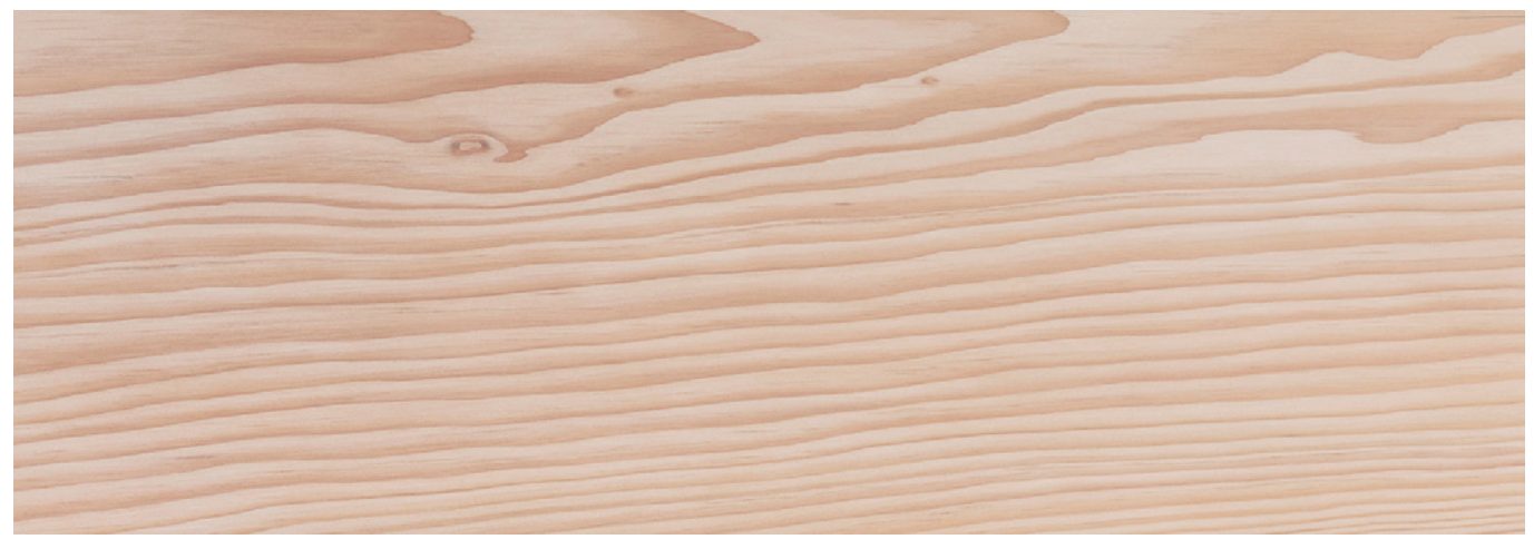
White oiled European Douglas fir

Our white oil finish provides a renewable surface for enduring beauty.