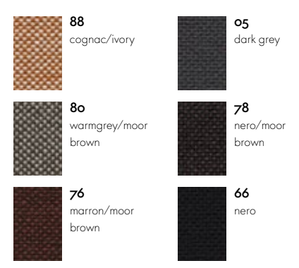
Seat upholstery Hopsak