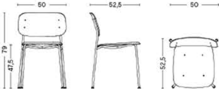
SOFT EDGE 10 CHAIR