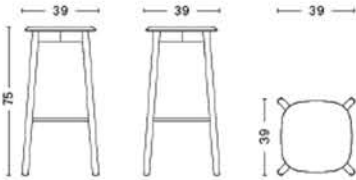
SOFT EDGE 32 BAR STOOL