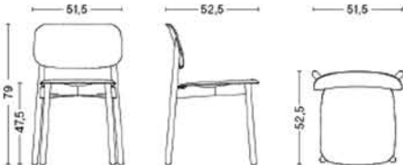
SOFT EDGE 12 CHAIR