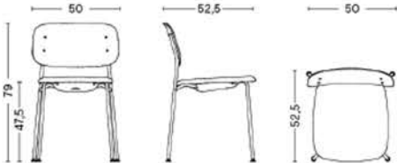
SOFT EDGE 10 UPHOLSTERY CHAIR