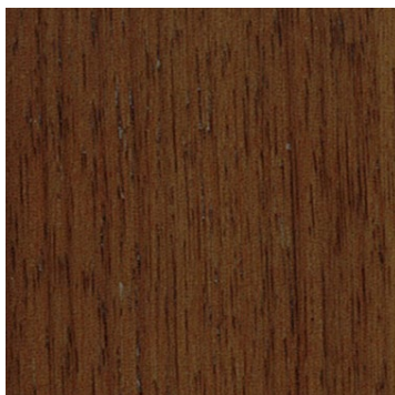
Oak stained walnut