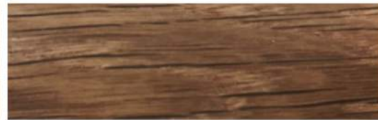
Oak - Smoked