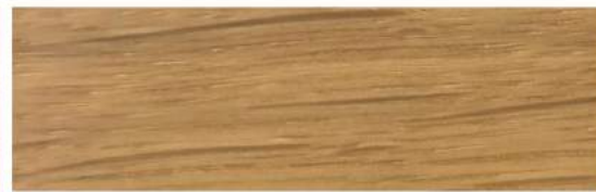
Oak - Oil