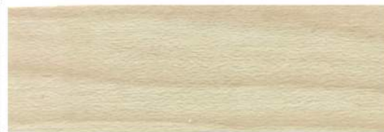
Maple - Lacquer