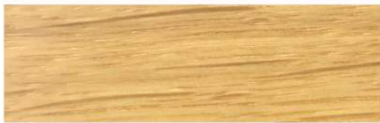
Oak - Lacquer