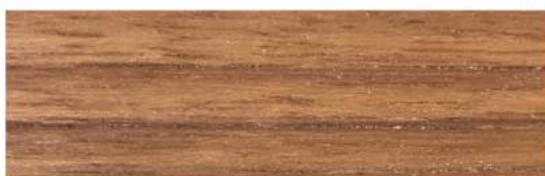
Teak - Lacquer