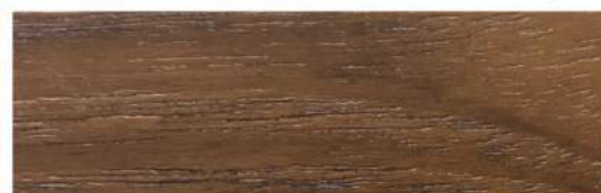
Teak - Oil