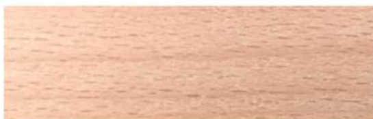
Beech - Soap