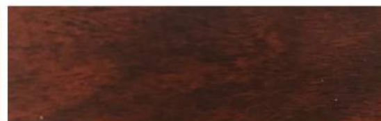
Rosewood - Lacquer