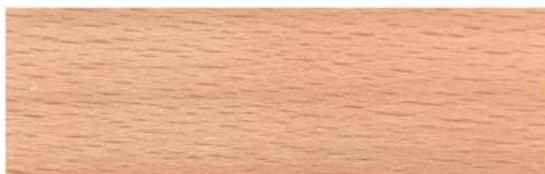
Beech - Lacquer