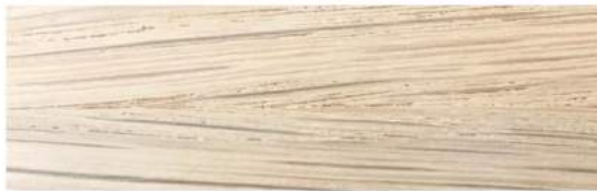
Oak - Soap