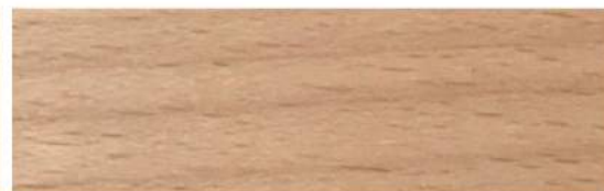
Beech - Oil