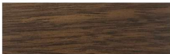
Walnut - Lacquer