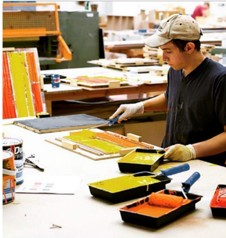
The variance in the opacity of the paint and texture is achieved through the hand-printing process