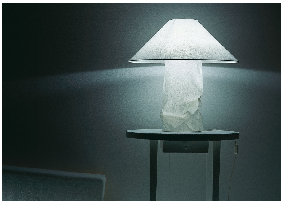
Lampampe INGO MAURER 1980

Japanese paper, metal. Lampampe is part of a series of simple lamps made of Japanese paper that Ingo Maurer developed in the late 1970s / early 1980s. In this design, he takes up the shape of traditional lampshades and yet formulates a new aesthetic. The shades are handmade in our production facility in Munich. The paper creates a soft, completely glare-free light. The paper is slightly creased as a deliberate design element.