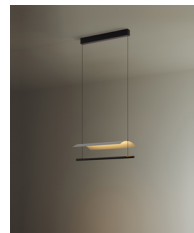
Lámina 45 / 85